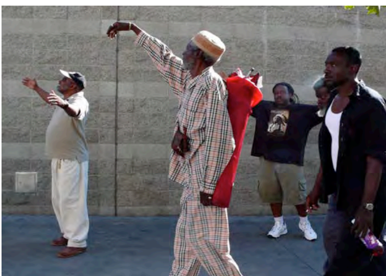
Utopia movement in front of the Midnight Mission

LAPD's UTOPIA / dystopia will engage long standing and new area residents to inform and broaden the public discourse, and use performance, public art, conversations, and convenings to articulate grassroots visions of the city's future. UTOPIA / dystopia will result in performances DEC. 6-9 at THE REDCAT THEATER that articulate the dreams and fears of people in the neighborhood.