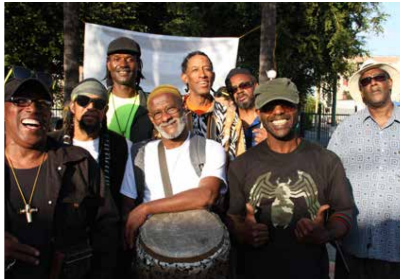
Skid Row Playaz