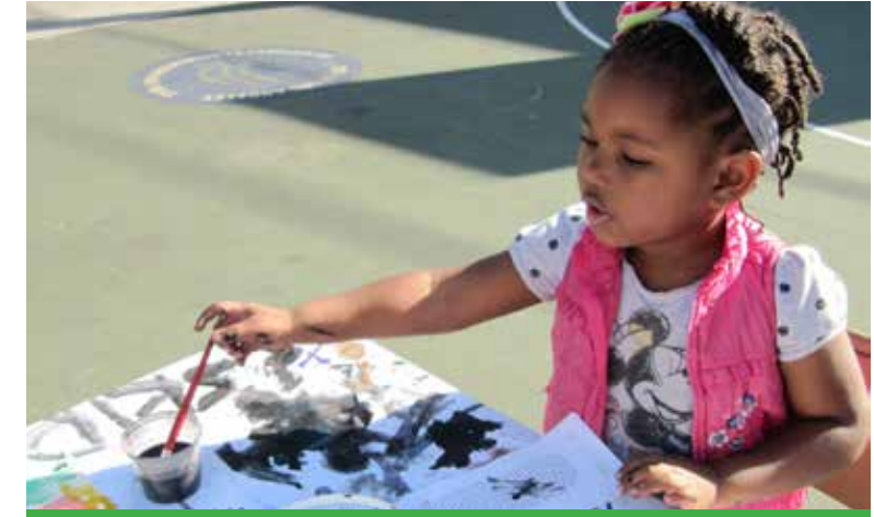
Having fun at the creativity station